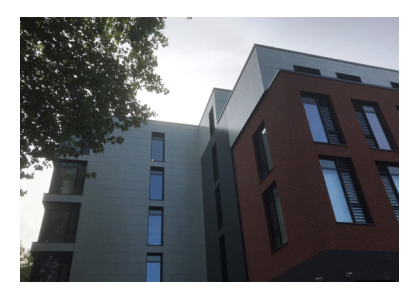
CPD events available

For those interested in finding out more, we provide informative RIBA accredited CPD sessions.