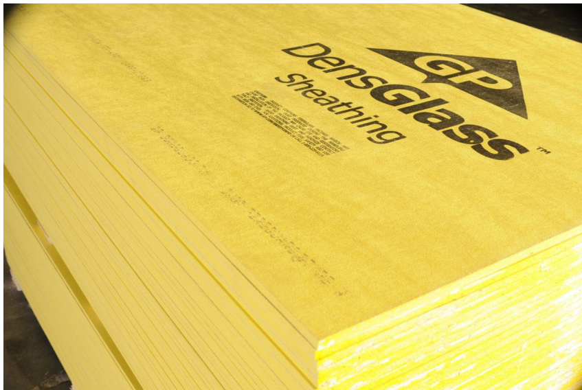
Typical Densglass board