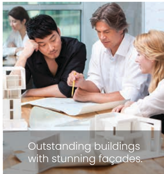
Outstanding buildings with stunning façades.

Understanding the needs and objectives of our customers is vital when developing new systems. Through collaboration, knowledge and experience, we create concepts and prototype drawings to address the current and emerging needs of our customers. Working closely with our supply partners, we draw upon their latest components to provide the best in product innovation. Through our collaborative approach, we help you create outstanding buildings with stunning, high-quality façades.