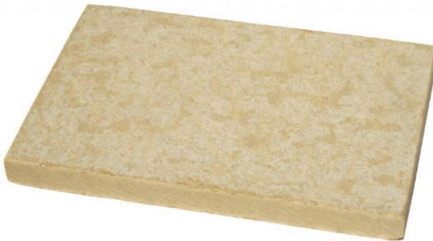
Typical Y-Wall board