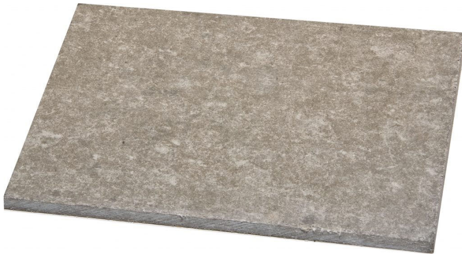
Typical Multipurpose board